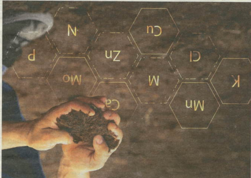
University of Illinois Extension will host a five-part educational series on conservation practices for farmers and landowners beginning Jan. 22.