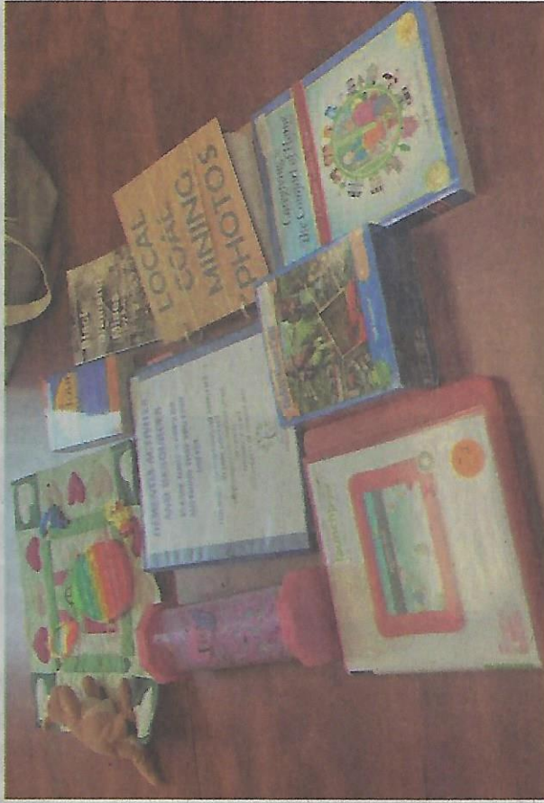
ABOVE: The Putnam County Public Library District has partnered with the Putnam County Community Center to create memory kits for early stage dementia and Alzheimer's individuals, their families and caregivers. LEFT: The kits that will be available for anyone to check out are on Starved Rock and local coal mining.

All that is needed to check out a kit is a library card. You do not need to be a Putnam County resident to check out a kit.